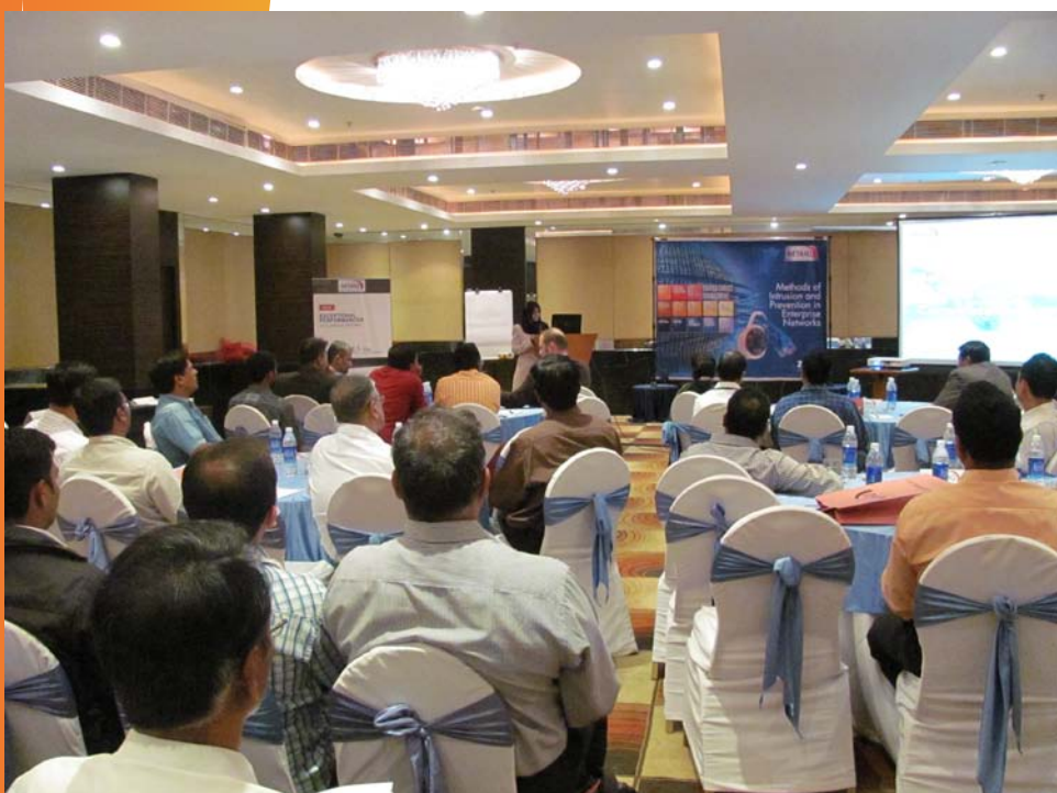
Figure 2A section of the audience